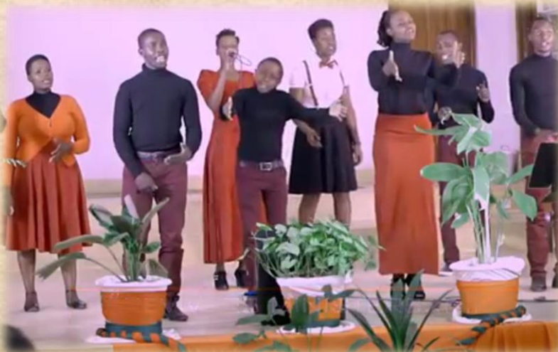
Fig. 1.1 Talented choir team