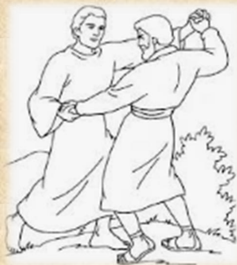
Fig 2.3 Jacob wrestling with angel

We should ever remain patient determined, humble and responsible and loyal