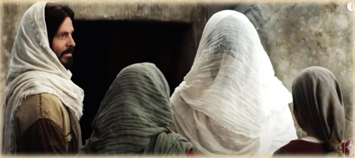
Jesus and Lazarus family at the tomb